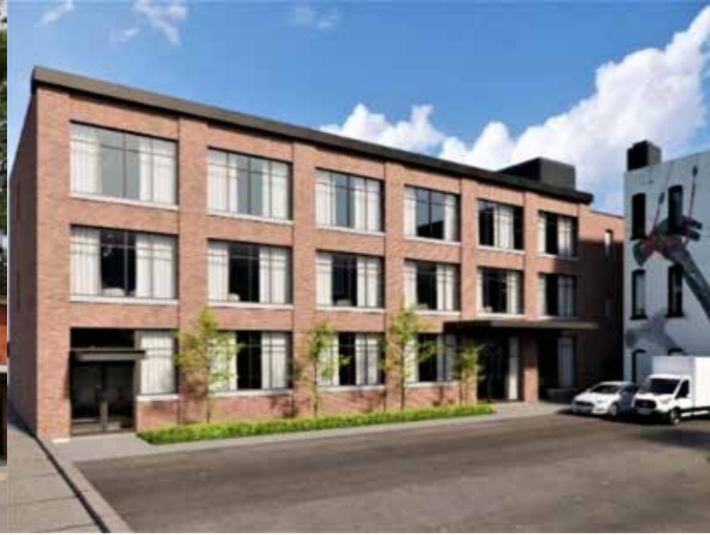
Mission Services' current Men's Shelter building, left, and an artist rendering of the new location

MSH's Men's Shelter operates with a housing focus. We provide a safe space for men and non-binary adults experiencing homelessness – either chronic or episodic, with the goal of assisting them to find sustainable, permanent housing.